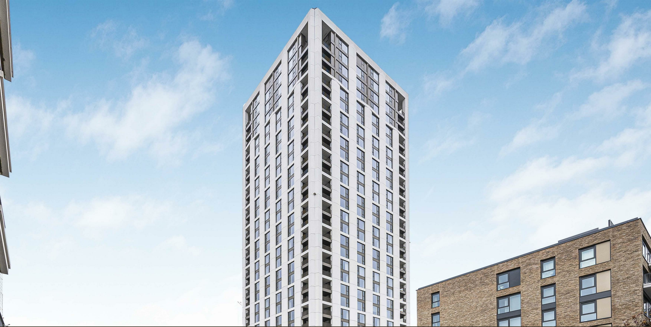
The Kings Tower, Fulham London SW6